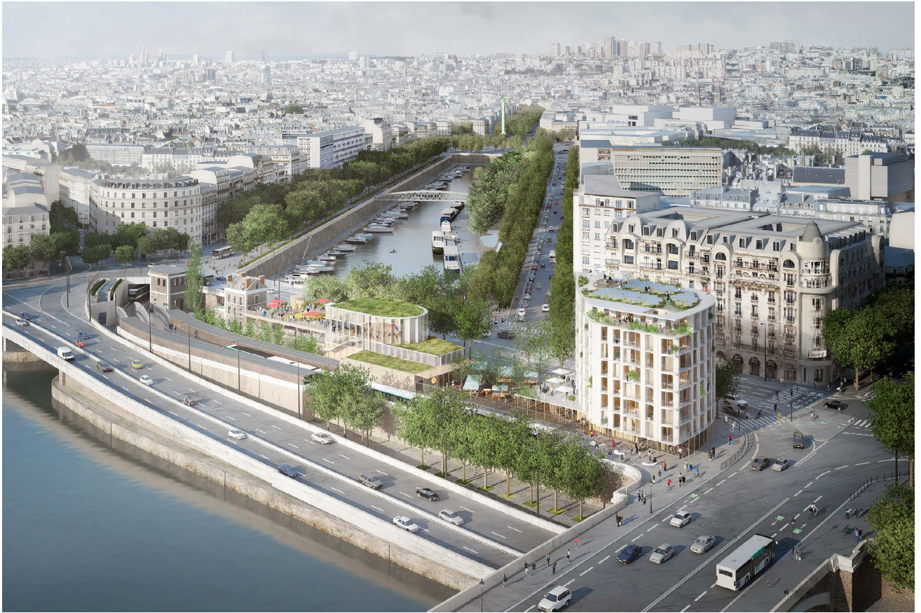
aerial view above Seine River