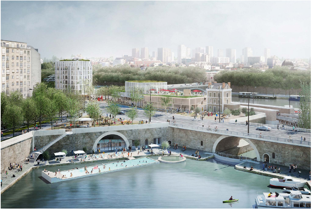
aerial view above Canal St. Martin