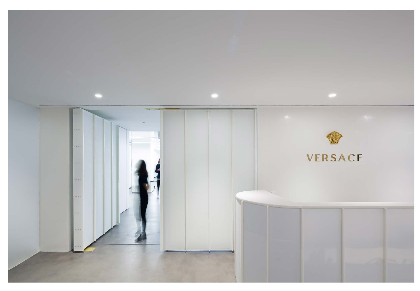
Reception and showroom entry